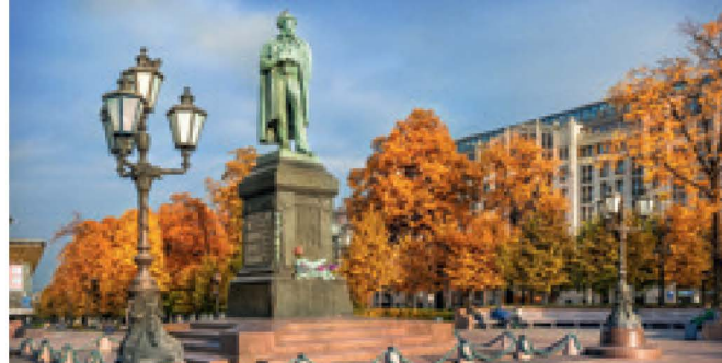
Moscow's Pushkin Square with German oak trees

The 7 retrievable frequency impulses, which are emitted from the GaAs crystal via the EIBA®-Mac base station, activate these holistic processes individually in a natural way. We have deliberately designed the EIBA®-Mac as a mobile 'wearable' suitable for everyday use, so that you can have a versatile helper at your side in the office, at home or when traveling.